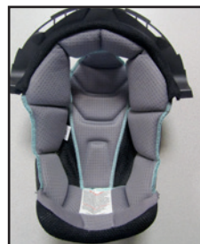
Moisture-Wicking anti-bacterial odor free interior