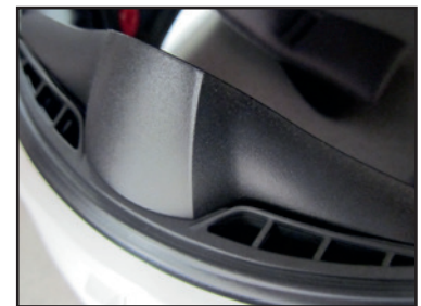
Removable breath deflector. Increased air circulation across the inside of the face shield