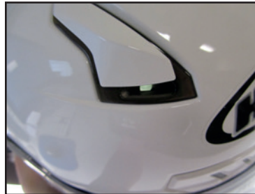
Two adjustable top vents.