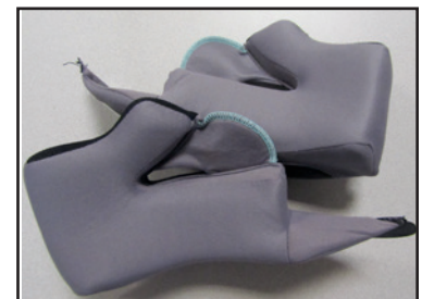
Cheek pads are interchangeable in all sizes