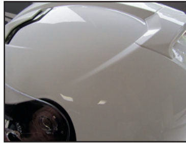
Sculptured shell lines flow from around the top vents to the rear spoiler