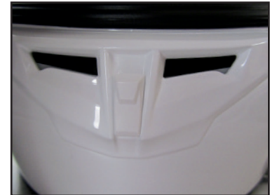
Adjustable lower vent with integrated injection molded interior