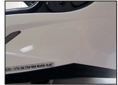
Aggressive lower gasket creates a forward motion